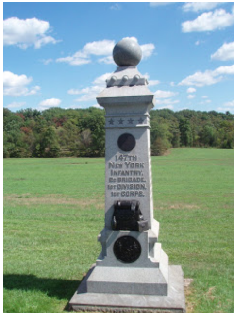
147th New York Monument

The 147th New York's monument stands along Reynolds Avenue, silently ( and incorrectly ) marking where the regiment bravely fought and fell on that July day in 1863. The monument lists the brigade, division, and corps of the regiment, along with the various other battles that are part of the regiment's story. It also lists the regimental losses as well - out of 380 men that started the fight on July 1, 212 men were killed and wounded. Placed by the veterans themselves, they knew what that monument represented. It represented the entire ordeal of their regiment and its brigade on the first day of Gettysburg.