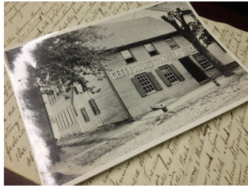
A photo, alongside the handwritten manuscript in the folder, showing the Compiler's wartime office on Baltimore Street.

When they were translated into type, when the sorts were laid in the trays and the paper was ready to print, the italics became uniform. The anger was there, but not nearly as palpable. But in touching a simple sheet of paper, a tool of hatred from nearly a century and a half ago, you find Stahle's soul in neat, dark ink.