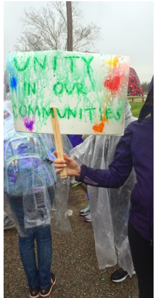
Rain can't dampen the spirit or the message of the Selma 50th Marchers

And we are a family now. It's odd to think of that idea from an interpretive perspective, but there are very few other words which truly fit. Wandering down the road and chatting about our world, our society, our nation, our lives with these couple hundred complete strangers feels like a family reunion.