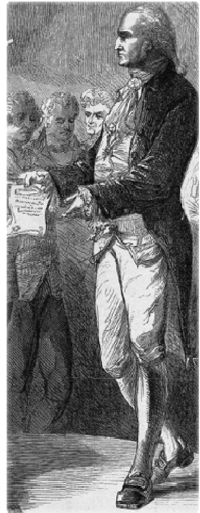
Washington as depicted in Harpers Weekly the following year, 1864.

From ev'ry mountainside Let freedom ring!