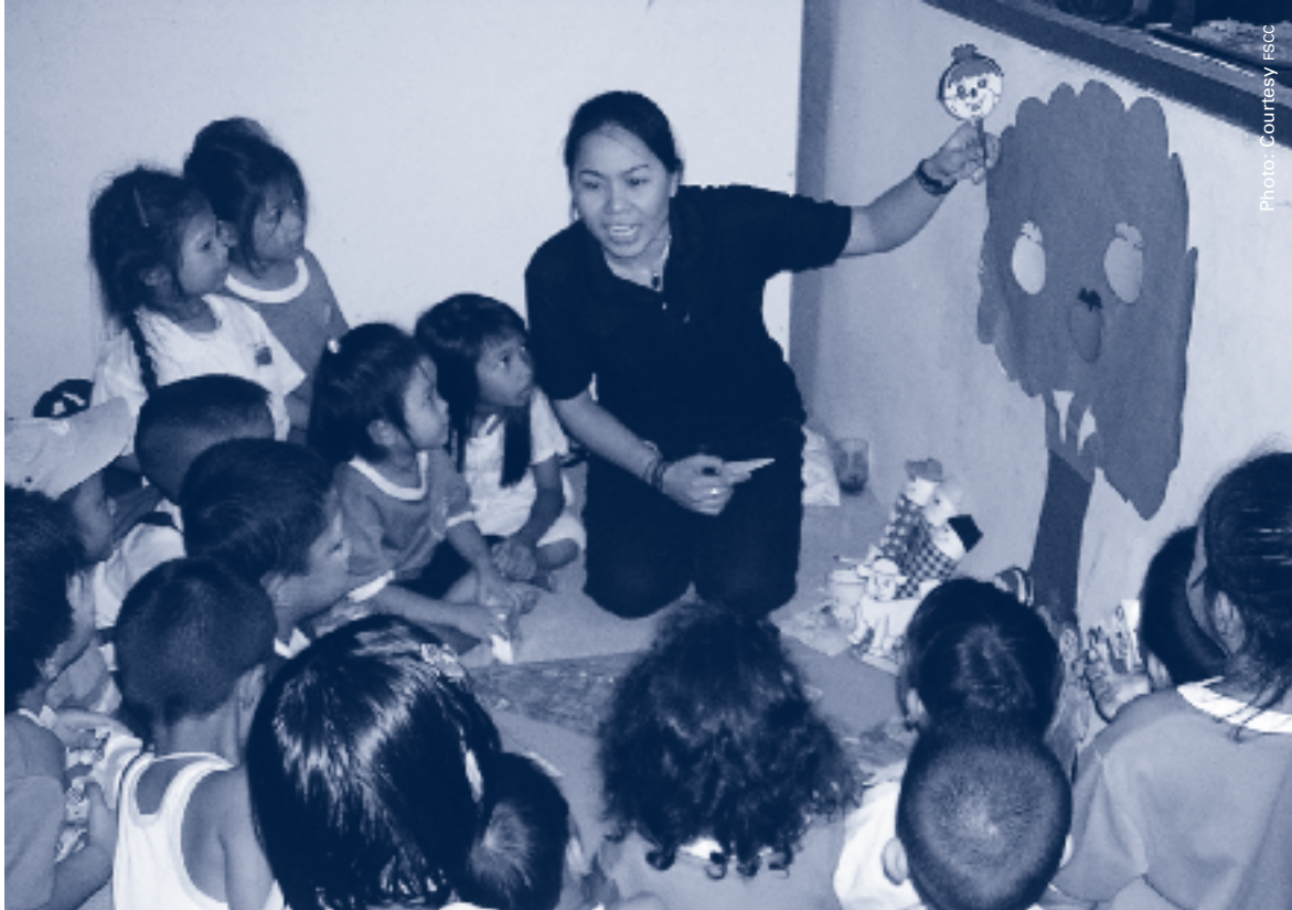
The Babies Second Home programme now has 185 caregivers in 104 daycare centres, benefiting more than 5000 children per year

and far-reaching approach. It became an important milestone for our work at fSCC.