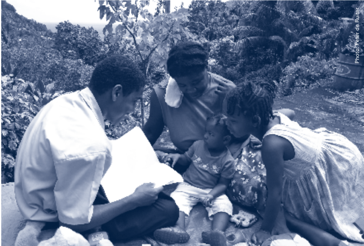
According to the Roving Care Program, parents and other caregivers within the home environment are the children's first teachers and therefore are critical in nurturing a child's cognitive and social skills