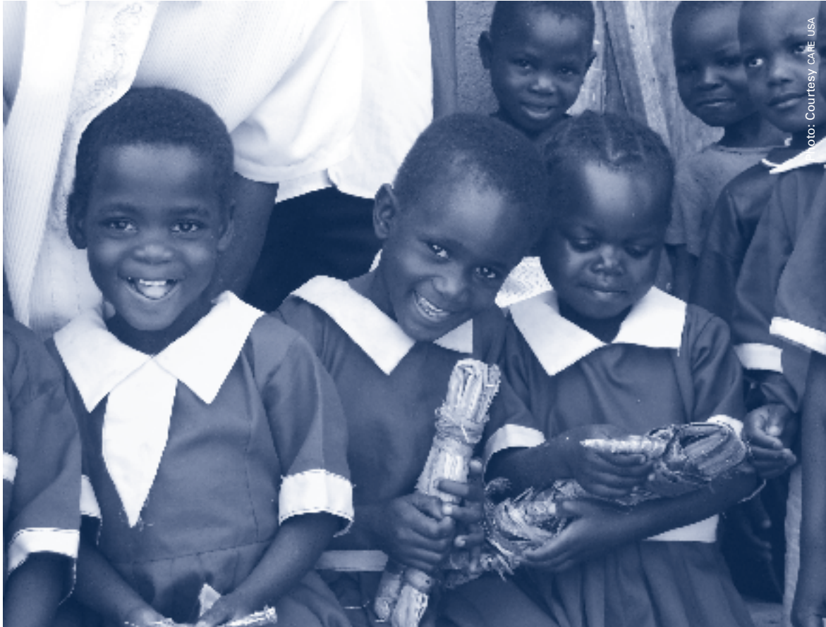
Childcare settings such as an ECD centre can provide an effective focal point around which services benefiting caregivers, households, and individual children can be organised and delivered

aspects of physical development as good nutrition. Growth failure in early life has been attributed to emotional neglect as well as poor diet.