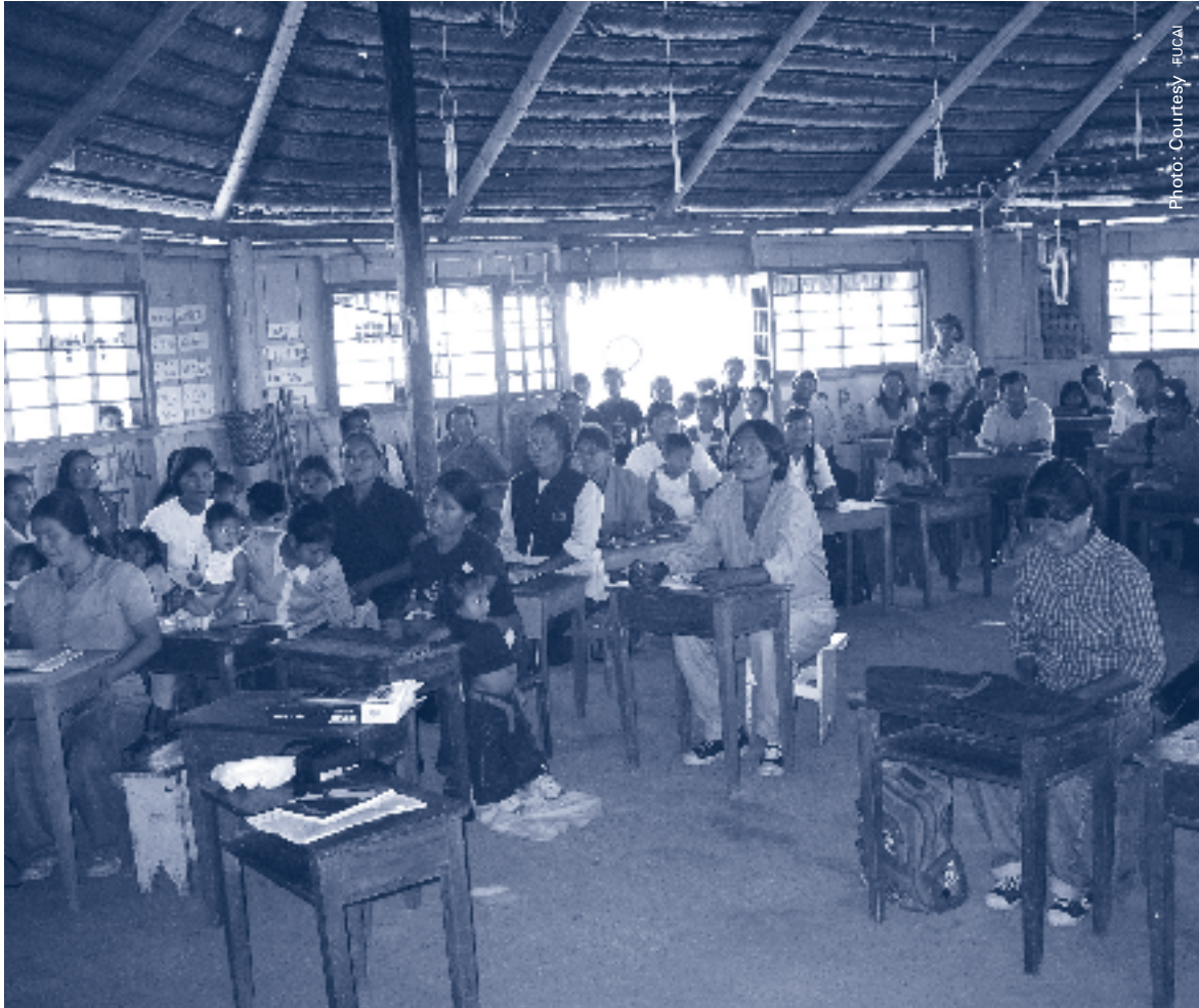
The focus groups of the Amazonas Indigenous Children project are parents, grandparents, indigenous leaders, authorities and teachers – the entire community is seen as the agent for the protection and care of the children

research, which seeks to generate knowledge that can be used for training participants and improving the situation for children.