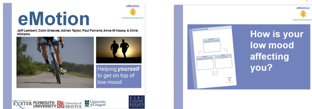
Figure 2. eMotion platform content