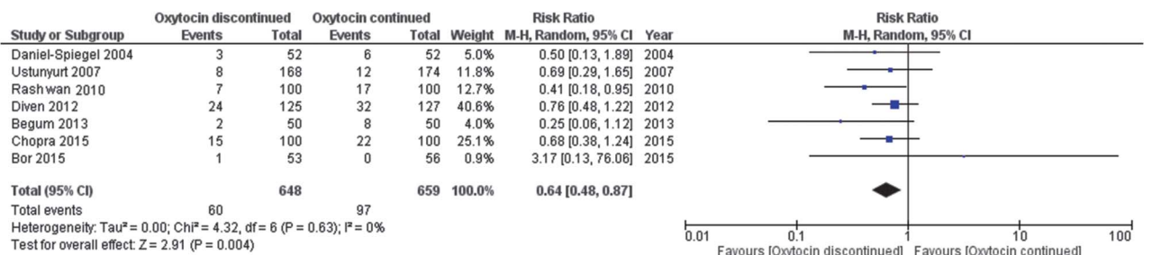
Fig. 2. Forest plot for the risk of cesarean delivery. M-H, Mantel-Haenszel test; df, degrees of freedom.

The definition of active phase was different among the included trials, but in most of them, it was defined as 5 cm or greater cervical dilation (Appendix 4, available online at http://links.lww.com/AOG/B22 ). Women in the intervention group