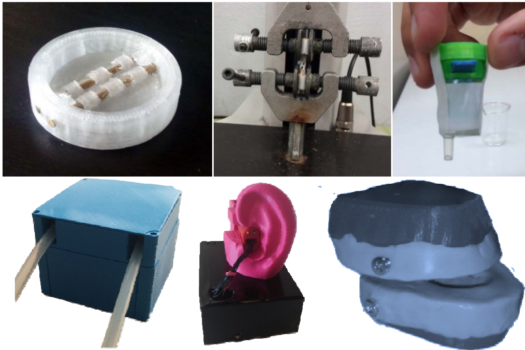
Figure 3. Examples of final results from different projects performed within the “Bioengineering Design” course at the MSc of Industrial Engineering. a) Instrumented heart valve. b) Scaffold for tendon repair. c) Intra-dermal micro-pump. d) Extra-corporeal pump. e) Ear-protecting device. f) Sleep apnea monitoring system.

Thanks to implementing the CDIO approach, students taking part in these subjects lived, for the first time, through the complete development process of an engineering system and are now better prepared for their final theses, as students themselves have highlighted in several occasions during these subjects. Some significant examples are provided in Figures 1, 2 and 3. In addition, they received, again for the first time, training in relevant engineering resources and improved their comprehension and application of several professional skills, all of which adds to the learning outcomes of these subjects. The experiences have been extremely rewarding, both for students and teachers, leading in some cases to spin-off proposals and to final degree theses.