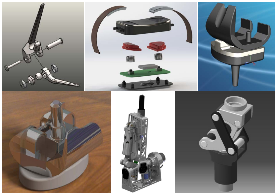
Figure 2. Examples of final results from different projects performed within the “Bioengineering” course at the MSc of Mechanical Engineering. a) Elbow prosthesis. b) Mouse for amputees. c-d, f) Knee prostheses. e) Ankle prosthesis.