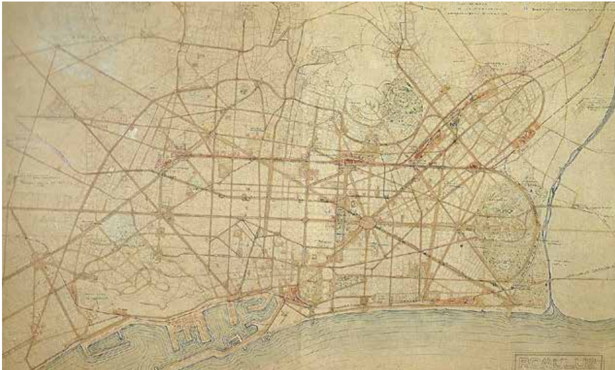
FIGURE 1 Barcelona: Jaussely Plan (1907)