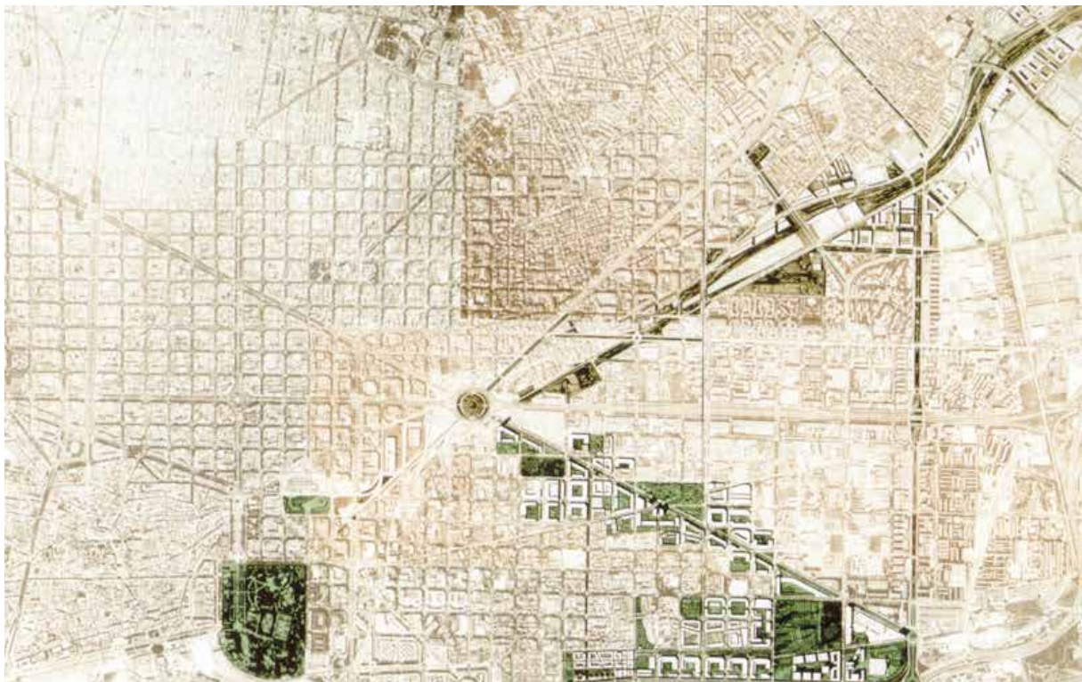
FIGURE 6 Barcelona: plans and urban projects (1992-2000)