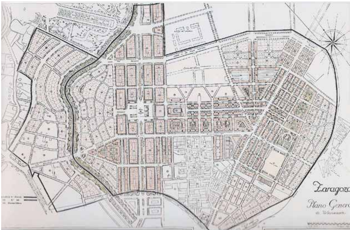
FIGURE 2 2. Zaragoza: Zuazo-Ribas-Navarro Plan (1928)