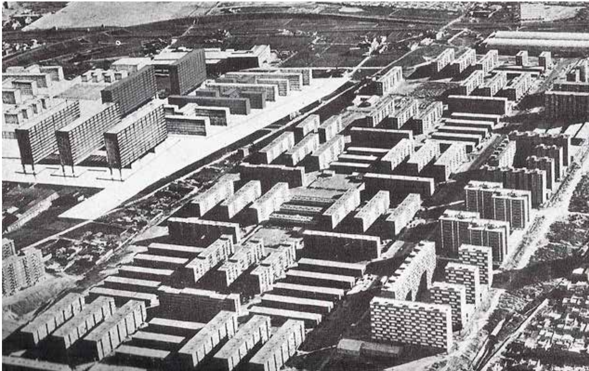
FIGURE 3 Barcelona: La Mina and Sudoeste del Besós housing estates (1969)