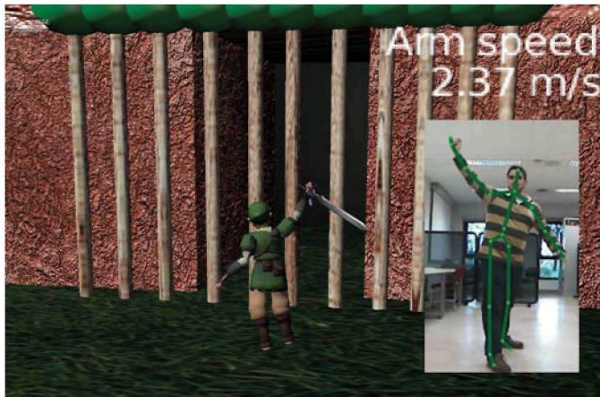
Fig. 2 Typical scene of the demo-game with user overlaid.

To perform preliminary tests with the add-on, a short adventure game has been implemented (Fig. 2). It constitutes a third person game with an avatar seen from backwards, which represents the player. In two scenes, different obstacles have to be conquered to prove different functionalities like jumping, bending down, reaching things and cutting barriers. It combines motion control with predefined animations, realized the recording function of the add-on.