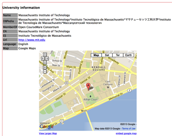
Fig. 2. Link from current OCW in Serendipity To Other LinkedData Source

result sets when searching your site. (ix) In cases that "advanced" search forms are not fun to use.