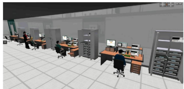
Figure 1. Laboratory room

https://www.youtube.com/watch?v=rZ5JTzch2cY&noembed=1