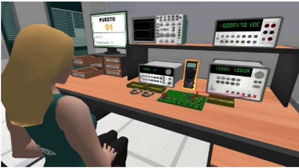
Figure 2. Workbench