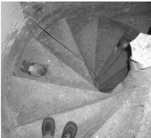
Figure 2 Last eight steps-flight of the staircase of Santa Cruz.

The staircase as the entire church was built up with limestone extracted from quarries located only a few kilometers away from Segovia. The limestone types used are Parral Stone and Bernuy limestone. The Parral Stone is a fine grain limestone, yellowish cream-colored and rosier than the Bernuy limestone.