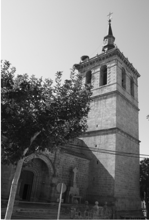
Figure 3 The tower of Tolosa. Santiago Apóstol church. (Photograph by P. Benítez)

Although the tower has an obvious Renaissance appearance, some late Gothic architectonic elements can also be found, as the staircase under study that runs it through. The entrance of this stair is located at the northeast of the church and it is divided in four flights.