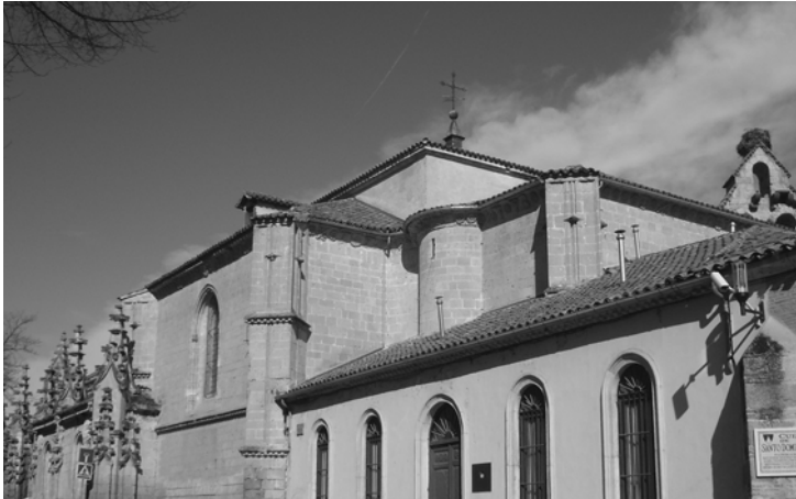
Figure 1 Church of the monastery of Santa Cruz la real. From left to right: staircase cylinder, apse and bell-gable.

The Monastery of Santa Cruz la Real is located in Segovia, outside its city wall near the Eresma River. It was founded by Saint Dominic in 1218 and rebuilt by order of the Catholic Monarchs in the late fifteenth century. Its reconstruction was according to plans of master Juan Guas, whose work in the monastery from 1478 until 1492, is known thanks to the Account Books of the construction of the Cathedral of Segovia. The construction project meant the construction of the late Gothic church as well as its main facade among some other works.