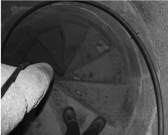
Figure 4 Staircase of Santiago Apóstol Church.