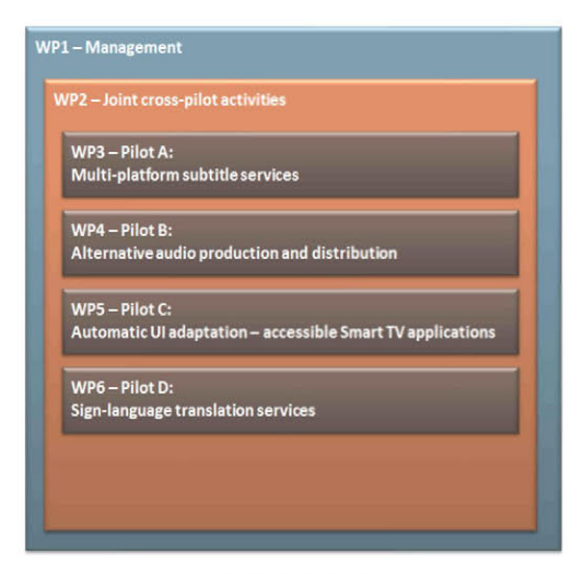
Fig 1. Project structure

of which needs dedicated technical implementations: Authoring, Standards and Technologies, and Contribution.