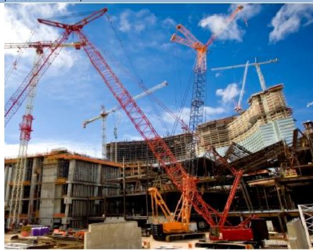
Figure 1 A typical building construction.

Within the area of public procurement, one particularly relevant and potentially sizeable risk is the construction risk in works contracts or other forms of contract, such as concessions or public-private partnerships. In this paper we shall consider construction risk essentially as the risk of deviation with respect to the costs budgeted for the works, for various possible reasons: incorrect specifications or measurements in the design, work delays, changes in the prices of inputs, unforeseen geotechnical problems, etc. Administrative procedures in many different countries reveal a series of different methods for