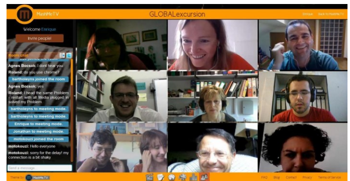
Fig. 3. Videoconference session among GLOBAL excursion consortium members and teachers

The videoconference is a one-time method while feedback tool and email are continuous in time. Reported feedback sometimes is objective (e.g. bug notifications) and sometimes subjective (e.g. impressions or experiences).