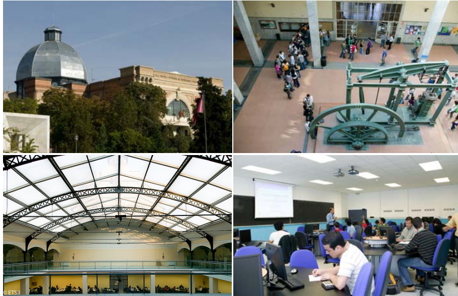
Figure 1. ETSII-UPM Campus, main hall and collaborative learning environments.

The level of commitment of our teachers with these educational innovation activities is noteworthy, as the teaching innovation experiences carried out in the last ten years have led to the foundation of 17 Teaching Innovation Groups at ETSII-UPM, hence leading the ranking of teaching innovation among all UPM centres. Among interesting CDIO activities our students have taken part in especially complex projects, including the Formula Student (since 2003), linked to the complete development of a competition car, and the Cybertech competition (since 2001), aimed at the design, construction and operation of robots for different purposes. Additional project-based learning teamwork activities have been linked to toy design and manufacture experiences, to the complete development of medical devices, to the implementation of virtual laboratories, to the design of complete industrial installations and factories, among other activities summarized in Table 1 and detailed in the references.