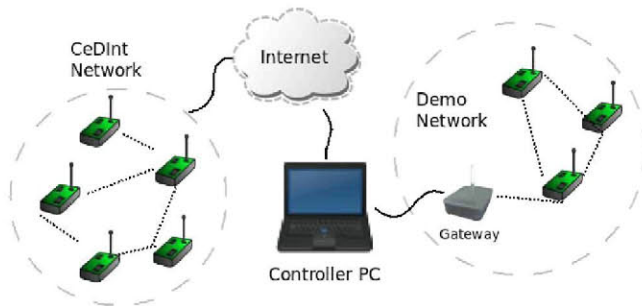
Figure 2. Demo deployment

The transducer modules that have been implemented are: