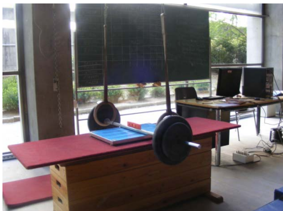
Figure 2. Detail of the height adjustment of the rings and material setting

A fitness bar with two discs on each side with a total weight of 367.76 N was placed between the rings to adjust the height of them, to generate sufficient tension in the cables and to serve the horizontal reference between the FP surface and the upper edge of the lower part of the rings (Figure 2).