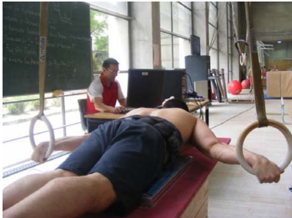
Figure 3. Starting position and grip of the gymnast on the FP.

• Phase 3. Isometric force phase . The gymnast performed strength levels close to his maximal isometric force (MxIF) values and try to maintain this level for 5 seconds. Graph shows an almost horizontal line around the value 0.