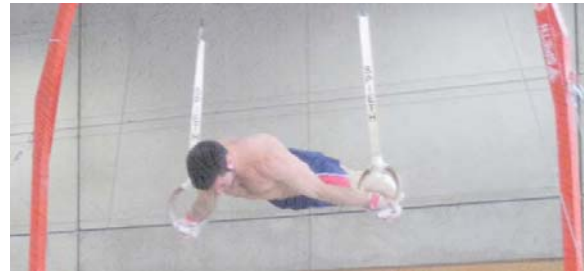
Figure 1. Gymnast performing a Swallow in still rings.

This element was selected because is a very common element that the vast majority of high level international gymnasts have in their competition routines.