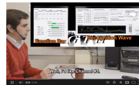
Figure 2: Screenshot from the demo.