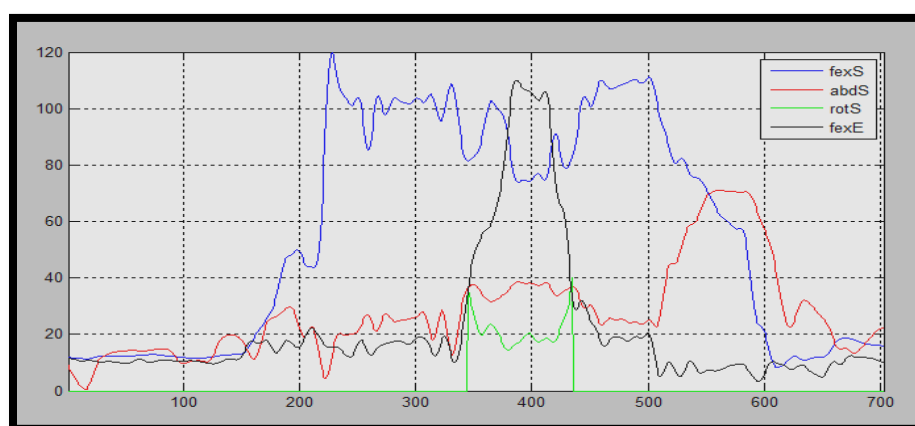
Figure 2. Analytic motion tracked

As it can be observed in Figure 2, all the DoFs have the expected morphology: fexS value is close to the 90° during most of the time; fexE value is close to 0° when the elbow is supposed to be fully extended and is close to 90° when it should be; in the last part of the plot, as expected, abdS takes a value close to 90°; finally both fexS and abdS return to the resting position.