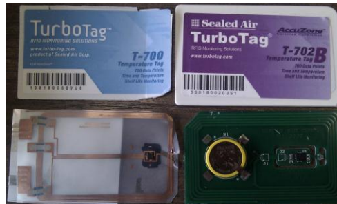
FIGURE 2: Turbo Tags T-700 and T702 with and without coating

The modified module is provided with: (1) Temperature and relative humidity sensor. Sensirion SHT 15, (2) Switch on/off, (3) Transmitter, receptor and (4) Electrical connector.