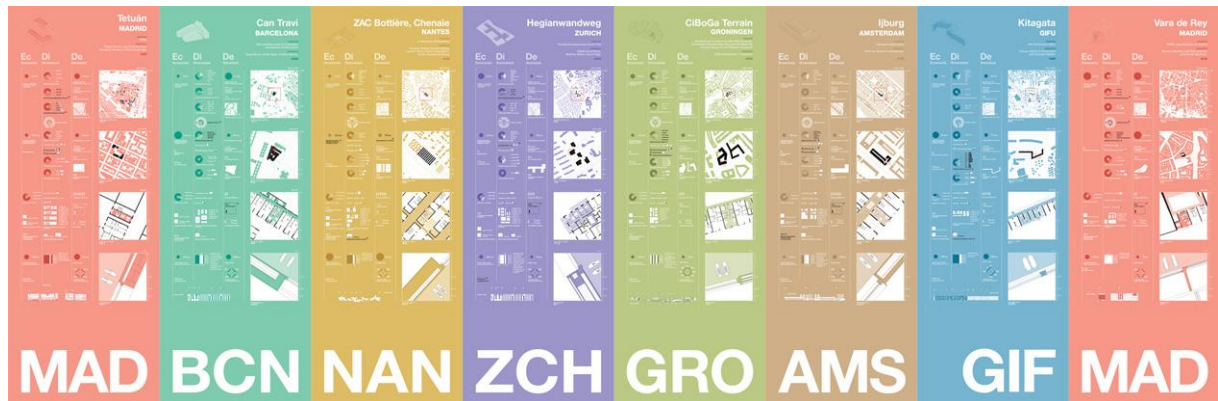
Figure 1. I+D+VS Exhibition panels: the integrated method applied to eight international social housing cases (Madrid, Barcelona, Nantes, Zurich, Groningen, Amsterdam, Gifu).

academic theoretical research and the average professional and institutional practitioners that deal with housing design. The alternative is probably not so much the return to purely intuitive procedures, but the moderate use of data processing, analytical methods and artificial intelligence, always subordinated to natural intelligence, and to more specific means of qualitative research, like architectural drawings.