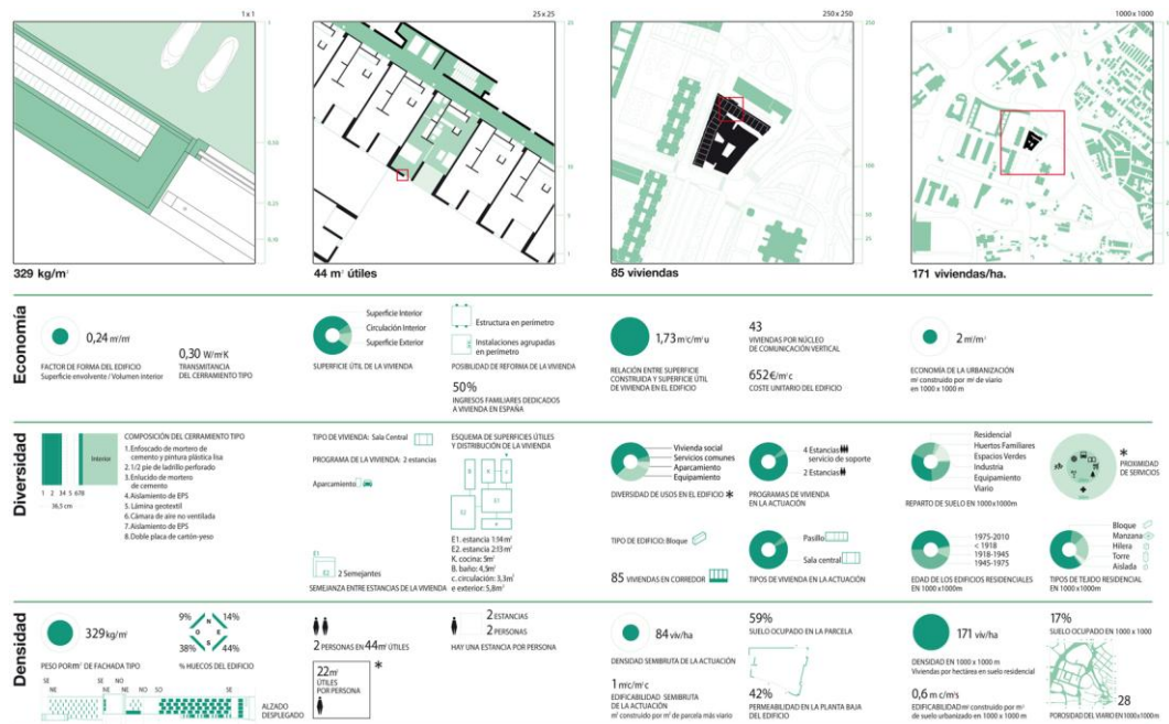
Figure 2. Analysis of a mix-use social housing building in Barcelona, Spain.

Taking these precedents into account, the new method proposes the use of common graphic and numerical codes for the analysis and comparison of social housing samples in different metropolitan contexts. Its most relevant premises are: