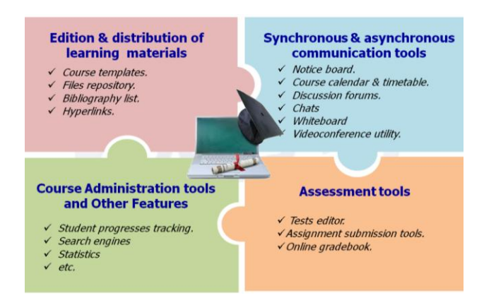
\textbf{Figure 1.} \ Main \ utilities \ of \ an \ e\text{-learning platform}.

According to [14], an e-learning platform should have at least the following utilities (Figure 1):