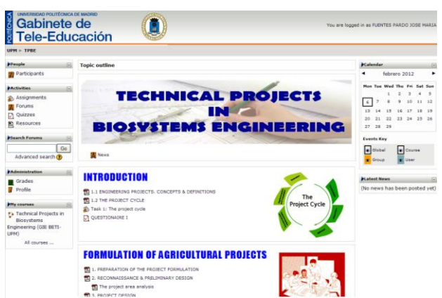
Figure 4. Structure of an e-learning course in Moodle 1.9.

Although most of the e-learning platforms enable teachers to form groups for collaborative learning activities, there are particular differences in their group work functionalities. Although nearly all the VLEs enable teachers to email a group specific notices and information, not all of them allow instructors to deliver specific assignments or assessment tests for a particular group not accessible to the rest of the class. The Sakai 2.5 e-learning platform, for example, assigns each group