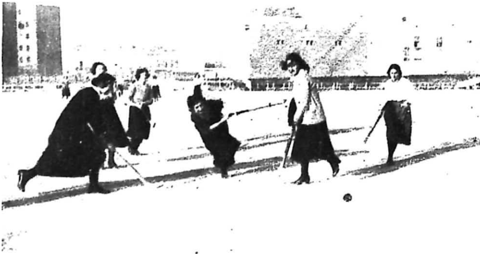
Figure 5. Atlético de Madrid ladies playing hockey.

In an article in the Heraldo Deportivo we can witness the increasing preoccupation about professionalism and its spread to other sports: