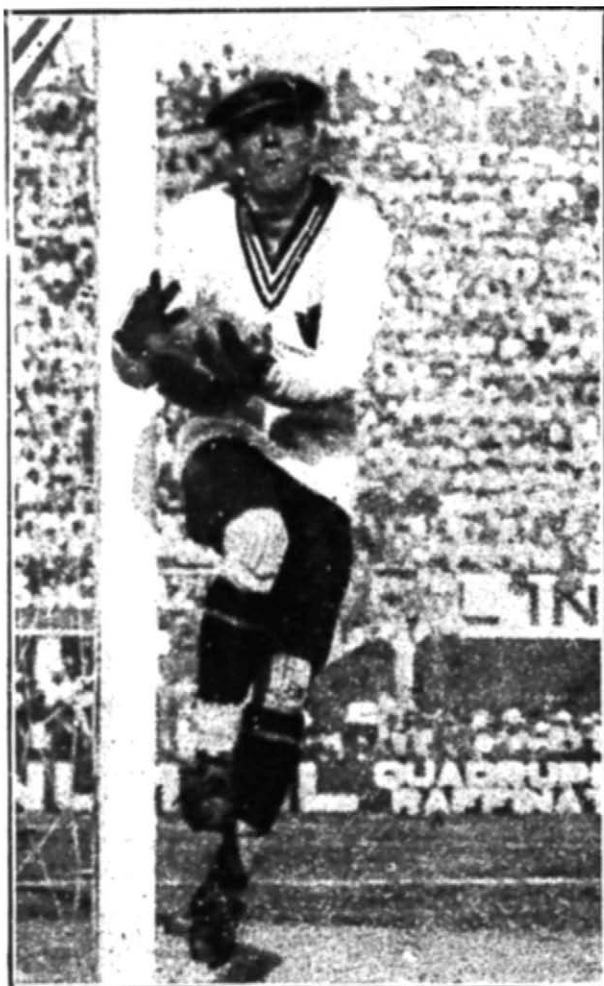
Figure 4. Ricardo Zamora, Ambers Olympics (1920) medallist and first Spanish professional football player.