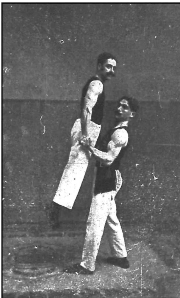
Figure 2. Members of the Royal Spanish Gymnastic Society exercising.

Its work was rewarded by King Alfonso XIII, who bestowed the title of 'Royal' to the society in 1916. 28