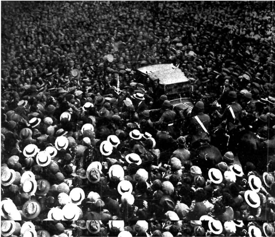
Figure 3. A big welcome to the heroes of Plus Ultra .

and later to the spectacular ‘dirt-track’ speedway imported from the UK, where it was already a professional sport. Massive crowds attended this spectacular discipline. Little by little, Barcelonan and Madrilenian riders caught up with the British motorbikers who were considered until then the competing aces in Spanish stadiums. The sporting press of the 1930s presented speedway as one of the most exciting and interesting spectator sports for the public.