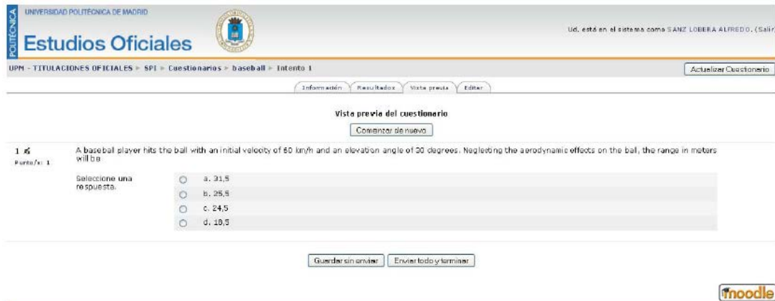
Figure 5: Final view in b-learning platform

into b-learning platform, obtaining a result as shown in Figure 5, which has been copied from Moodle platform at Polytechnic University.