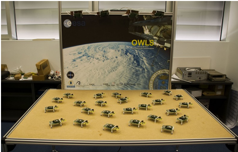
Fig. 2. System overview

The whole system can be randomly deployed on a table as shown in Fig.2. Central node's emitter and receiver are placed at a variable distance over the table to ensure visibility from all the nodes (which is not necessary in closed environments). Nodes are powered by 2 standard AA batteries (3 V), except for the central node which uses its own power supply unit.