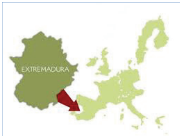
Figure 1: Autonomous Community of Extremadura in Spain

The geographical context for this study is the Province of Cáceres, in the Autonomous Community of Extremadura, a region in the mid-west of Spain, bordering on Portugal.