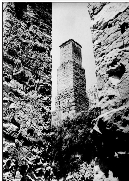
Fig 3. Colonial smelting of Qoripaccha, Huancavelica, Peru.

The amalgamation process for the new silver mines in South America needed an enormous amount of mercury. Mining highly increased during the 17th century and new deposits such as Almadenejos were discovered nearby. In 1755, at the old Castle mine, the worst fire ever broke out in Almaden. Due to bad mining conditions and huge amounts of wood for timbering, the fire easily spread throughout the mine. The fire burned for two years! The world's total cinnabar production decreased and the global trade was filled with ore from Idria.