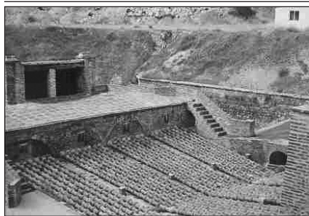
Fig 4. Bustamante kilns, Almadén.

was divulged and the development of a mining park was requested. Within this park, the following buildings and mining plants must be considered: the Almadén Old mine and Nueva Concepción mine in Almadenejos; the Academy of Mines (18th century; Fig. 5); San Rafael Hospital for Miners (18th century); hexagonal arena (18th century); Fúcares House Palace (16th century); the old San Carlos shaft 6 in Almadenejos (18th century; Fig. 6); aludeles or Bustamante kilns (17th to 20th centuries); Carlos IV Gate and the metallurgy enclosure of Almadén (18th century); metallurgy enclosure in Almadenejos (18th century); sentenced' gallery 7 (18th century); Retamar Castle (Middle Ages); San Aguilino; San Teodoro; San Joaquín shafts and Diógenes mine; and the House of the Superintendent. The historical mining in Almadén and Puertollano (coal) is integrated in the Spanish possible candidates for the World Heritage List.