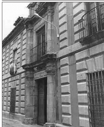
Fig. 5. Almadén School of Mines.

Quinto del Hierro , i.e., Fifth of Iron, with large developing narrow trenches.