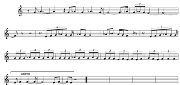
Figure 1: Manual transcription of a cante (debla).

Debla: "En el barrio de Triana" Chano Lobato