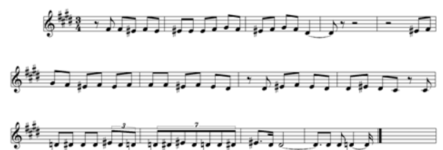
Figure 2: Transcription of another version of the previous cante .