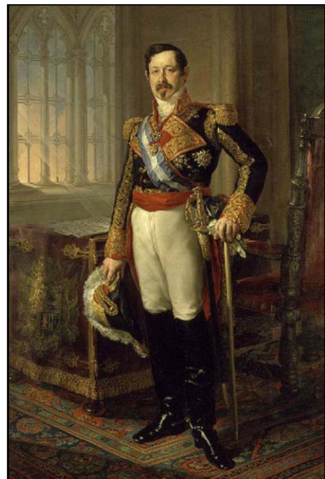
Figure 7. Ramón María Narváez, Prime Minister when professional competencies in Telegraphy were returned to the Ministry of Interior.

Only people applying to become part of the Security and Services Subordinate Staff did not need to pass any examination to be hired.