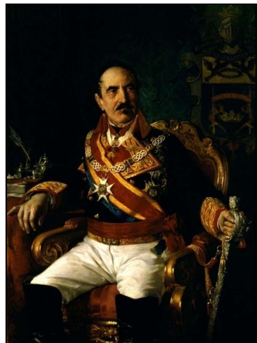
Figure 6. Portrait of General Espartero, Prime Minister after 1854 coup.

Political criteria then changed and Telegraph Policy was revised, but the old rivalry between the Ministry of Public Works and the Ministry of Interior still went on. In 1855, the Ministry of Interior was coming up with a Telegraph Bill when the Ministry of Public Works took that opportunity to gain control over the telegraph system by claiming professional competencies only for Civil Engineers and calling for the close of the Telegraph School created two years before [11]. When the Spanish House of Representatives passed the Bill on April 22, 1855, the resulting Telegraph Act conceded a momentary victory to the Ministry of Public Works.