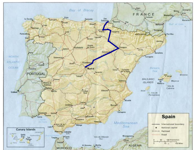
Figure 4. First long distance telegraph line laid in Spain.

But, to the Ministry of Interior, electric telegraphs were a new technical discipline and, for this reason, a new professional group was required to operate and maintain electric telegraphs and, if needed, to develop the requested network too. That was the rivalry between both Ministries at that time and it would be so for a long.