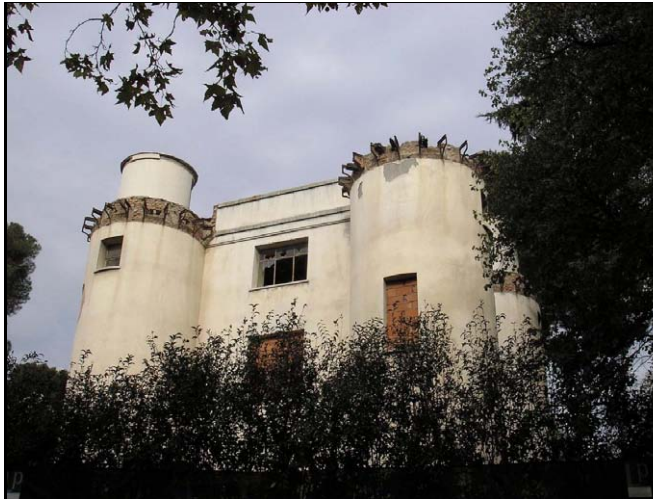
Figure 5. Present view of the first Telegraph School in Madrid.

The Spanish historian Sebastián Olivé refers an early inventory document coming from this building that contained some entries referring tables, chairs and other different objects; among them two telegraph instruments [1]. Probably, those apparatus might be two 2-needles Wheatstone telegraph equipments, as they were the type of telegraph used in Spain at that time, before the introduction of Morse telegraph equipments.