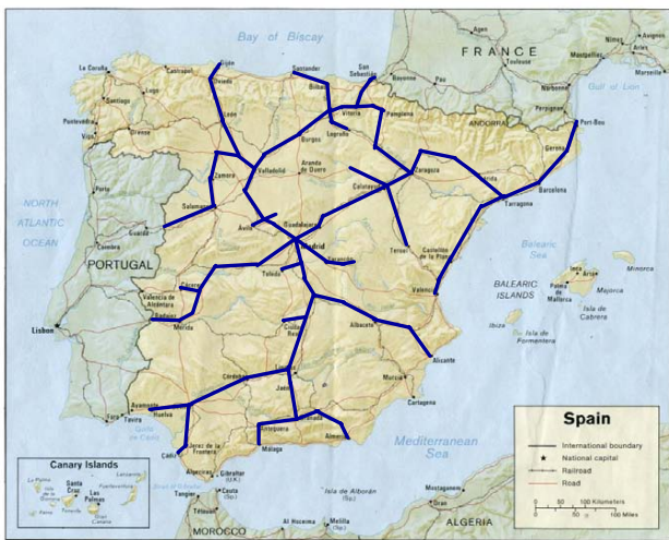
Figure 8. State of the telegraph network in Spain in late 1857.

Map in figure 8 shows the state of the Spanish telegraph network in late 1857, three years after concluding the telegraph line construction between Madrid and the French border. At that moment, there were 5,381 Km telegraph lines deployed, 101 telegraph stations and 42 of 50 province capitals connected. That year, optical telegraphs were definitively abandoned and electric telegraphs began to be considered as a useful and usual communication media for journalists, politicians and business people in Spain.