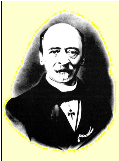
Figure 3. Portrait of José María Mathé, Director General of the Spanish Optical Telegraphs in 1852.

months and, after returning, he devised a plan to create an educative center to teaching the deployment of telegraph lines and the operation of the transmitting and receiving instruments.