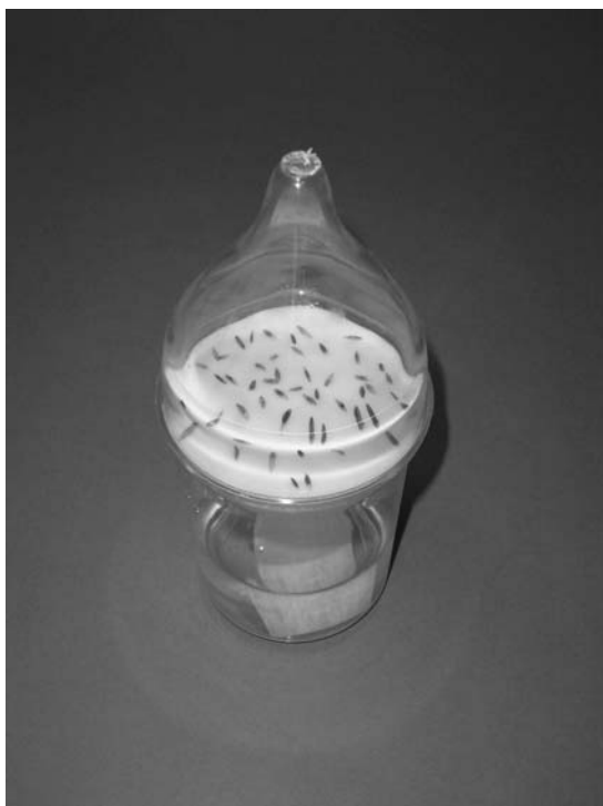
Picture 1. Detail of containers especially designed to germination test. Seeds are placed in filter paper and water goes up by capillarity.

Parameters used to evaluate germination were: number of germinated seeds ( G_{\max} ), mean germination time (MGT), the time required for 1%, 10%, 25% etc. of the seeds to germinate ( T_1 , T_{10} , T_{25} , T_{50} and T_{75} ) provided by the Seed calculator software package (Jalink and van der Schoor, 2002). Germination curves have been plotted. Germination tests were realized for three months corresponding to the 2007 spring season.