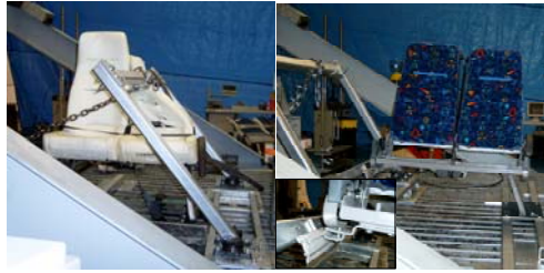
Fig 2. Lateral strength tests.

First of all, the mechanism of deformation of these components under rollover has been defined, estimating the loads that could be transmitted by the restrained occupant. Some tests have been defined and some current seats has been tested to characterize them and to determine if it could be necessary to establish new requirements to guarantee the correct retention of the coaches' occupants in a rollover accident.