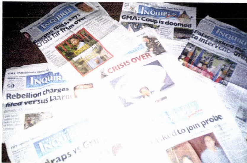
Figure 1.2. Local headlines after the failed July 27, 2003 mutiny of rebel officers in the Philippines.

Ninoy Aquino International Airport (NAIA) Control Tower II takeover by the former Air Transportation Office (ATO) chief 6 . The incidence of crime, specially in urban areas like Metro Manila, has also escalated over the past years causing concern for government authorities and the Filipino people.