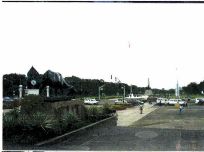
Figure 1.4. Rizal Park in Manila where the country's national hero, Dr. Jose Rizal, was shot by the Spaniards in 1896.

Furthermore, security conditions within the country continue to deter the tourism industry from reaching set targets in tourist arrivals and receipts. Political events in Philippine history like People Power I 7 in 1986 and People Power II 8 in 2001 appear to have affected the influx of tourists. Coup d'états, like the recent one in July 27, 2003 in the middle of Makati City, labor strikes, and civil protests, could pose a problem for tourism in this democratic country. There are also threats of terrorism within the country, particularly in the South, and from the international arena triggered by the US-Iraq/Middle East conflict. The incidence of crime, especially in urban areas in the Philippines, is thought to continue to scare potential tourists away.