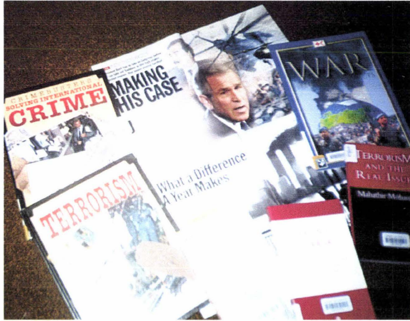
Figure 1.1. Media's presentation of key security events in the 21 st century.

Front (NDF) 2 and the People's Army (NPA) 3 , respectively. There are other internal security issues beleaguering the government involving the Moro Islamic Liberation Front (MILF) 4 and the Abu Sayyaf Group (ASG) 5 , a separatist group operating in the southern Philippines. In 2003, the country had at least three notable threats to national security specifically the March bombing of the Davao Airport, July mutiny of rebel soldiers (see Figure 1.2), and the November