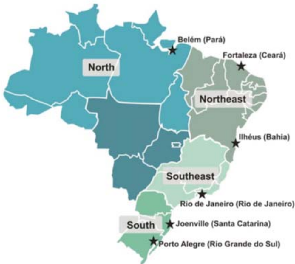
Figure 5 Map illustrating the five geographical regions of Brazil (Pena et al., 2011, p. 3)

Janeiro, as well as significant agricultural output. 2011 figures showed 42 per cent of the population live in the urbanised Southeast (Coy, 2016, p. 51), generating 54.4 per cent of the country's GDP (Azzoni, 2014, p. 4). These figures contrast with the stagnating and semi-arid region of the Northeast, which only generated 13.4 per cent of national GDP in 2011 (Azzoni, 2014, p. 4).