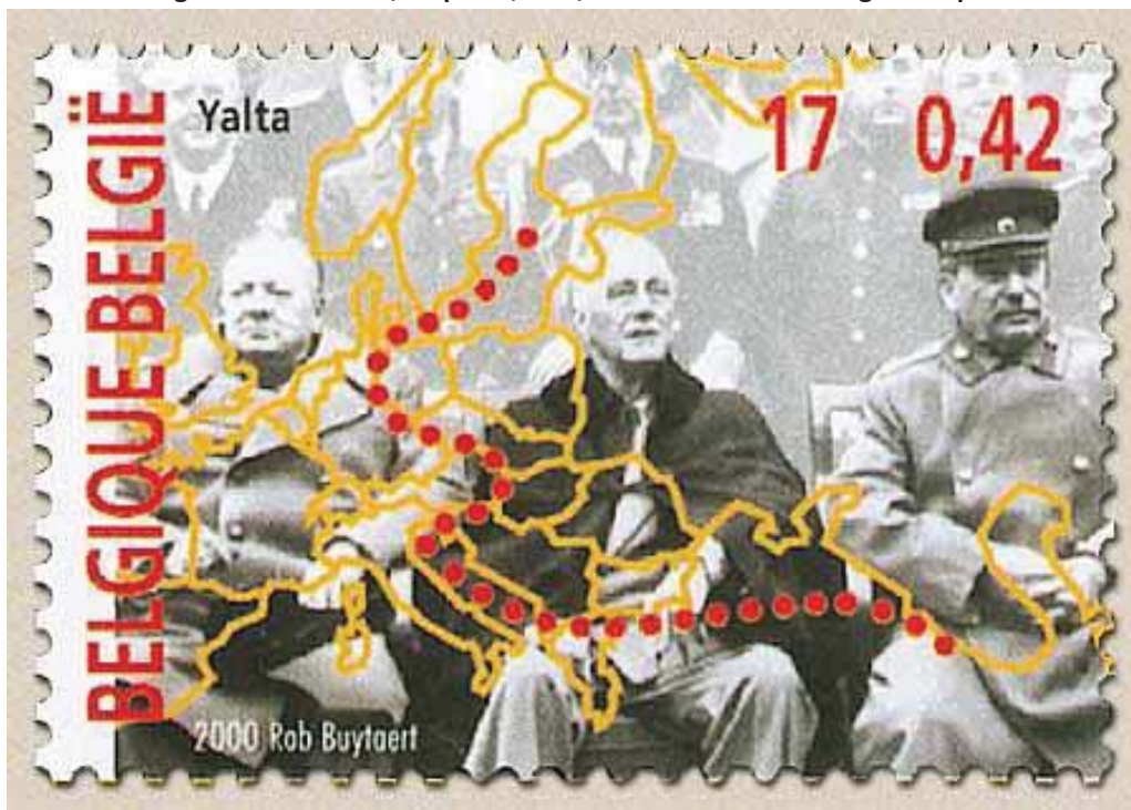
Figure 3: Politicians, Disputes, War, Boundaries and Postage Stamps 1