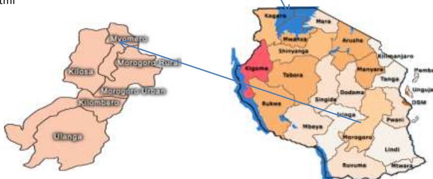
Figure 1.2 Maps of Tanzania and Morogoro Region showing Mvomero District