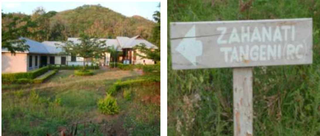
Figure 3.2: Tangeni Dispensary, Morogoro, Tanzania.