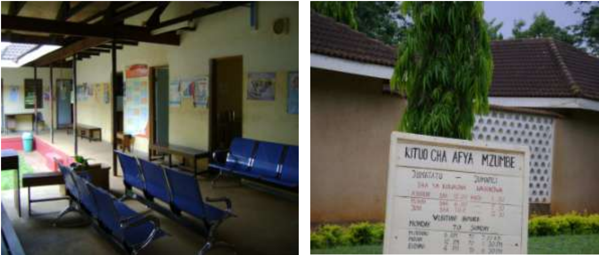
Figure 3.1: Mzumbe Health Centre; Waiting area for antenatal clinic and outside appearance