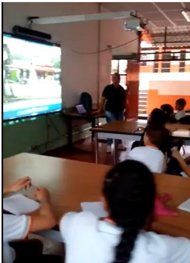
Figure 2. Presentation of pictures about Kennedy's neighborhood

the places in their neighborhood ( see Figure2 ). Giving the fact that students already knew those places, they created an immediate relation between the vocabulary and the real places and it was not necessary to translate to L1 the new words for them to understand, thus they actively participated in the practice stage.