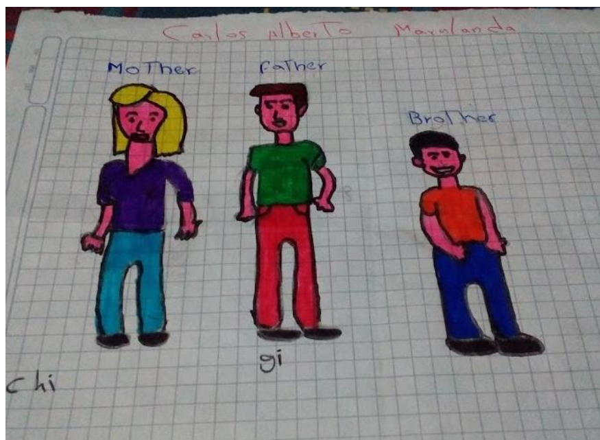
Figure 7. A student's strategy for oral presentation

However, the pre-service teachers tried to maintain the freedom and let them draw as they perceived their families. For instance, some of them only draw faces, others complete bodies, and others represented their family members with different objects like animals or flowers. At the time of developing the presentation, the linguistic outcome had different manifestations. As a matter of fact, some students did the presentation by hearth, others wrote the real names of their family members, others only wrote pronouns like he or she, few of them wrote the complete sentence "he is my father", and finally, others wrote some words to remember the pronunciation ( see Figure 7 ). But at the end, all of them used the drawing as a support to point out or remember the family member they were about to name.