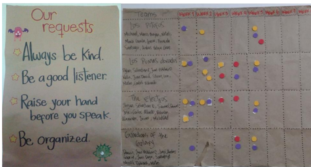
Figure 1 Classroom requests and points' poster

problems by establishing ground rules at the beginning of the teaching process, it can also affect positively students' behavior, and it was the case. As the pre-service teachers implemented that strategy from the beginning of the course, they could handle students better and avoid possible misbehavior troubles. In this sense, the pre-service teachers evidenced some professional growth by acquiring new strategies to deal with classroom management situations.