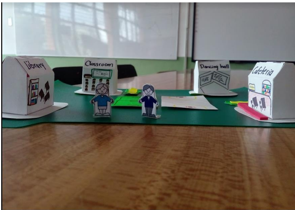
Figure 3. Architectural model made by students

In a second implementation of this technique, students worked on a hands-on activity where they had to create an architectural model representing some places at school and after finishing they had to use it to participate in a conversation ( see Figure 3 ). As stated in the article by Copperstein and Kocevar-Wiedinger (2004), when explaining the benefits of hands-on activities, "abstract concepts become meaningful, transferable, and retained because they are attached to performance of an activity" (p.145). In other words, when students have the opportunity to take learning into their own hands, they become proud and motivated to continue to grow and learn.