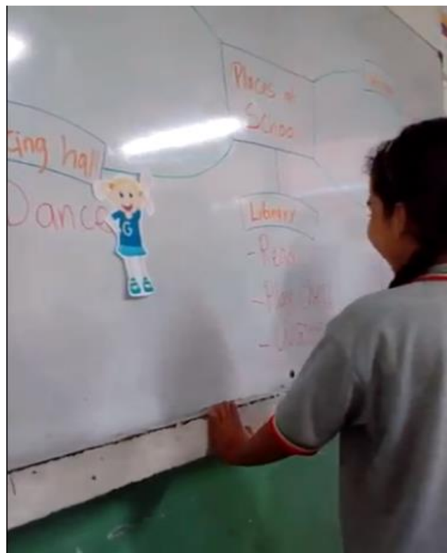
Figure 8. Students playing based on the mind map

After the presentation of this map, the pre-service teachers conducted a game in which we located a character (supposed to be the student) in a place, and they asked “what do you do at the library?” (see Figure 8) They made the connection in the map and answered “I read at the library” As most of them quickly linked the verb with the place and they spoke fluently, the pre-service teachers considered a positive result of the implementation of the map.