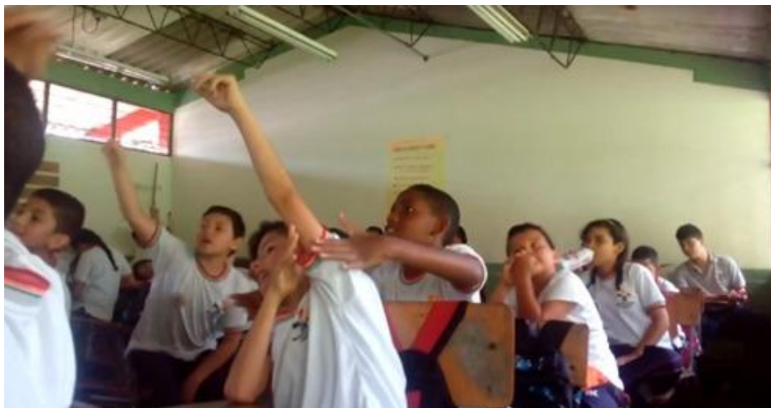
Figure 5. Students' actively participation

they just remembered and also they wanted to share more information such as the type of event they were in that memory ( see Figure 5 ).