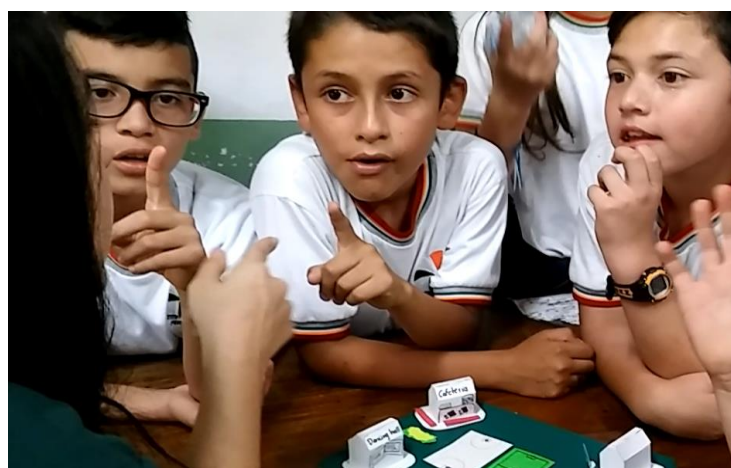
Figure 10. Students correcting their mistakes by repetition

In other cases, where the teachers just corrected any mistake to a student, some of them just affirm with their heads as if they understood, or just kept walking. However, in the best cases students immediately corrected the mistakes and interiorized the correct way to pronounce or say something by voluntarily repeating it many times ( see Figure 9 ). Arthur (2012) exposed that we can change the student's negative thoughts into positive ones just by providing them with positive words. In this sense, for some students this technique was effective because they could come up with their fears and assimilated the aspects the pre-service teachers told them to correct.