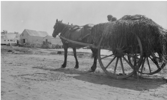
Gathering kelp in Rustico, Prince Edward Island, Canada.

details the harvesting of “mussel mud” as a treatment for the island’s acidic soils. Familiar narratives of over-harvest and collapse dominate Edward MacDonald and Boyde Beck’s history of fishing on PEI, but their examination of the island’s various fisheries provides interesting case studies of stocking schemes that led to the introduction of new, destructive species, and of high-minded conservationists in conflict with local laborers’ livelihoods.