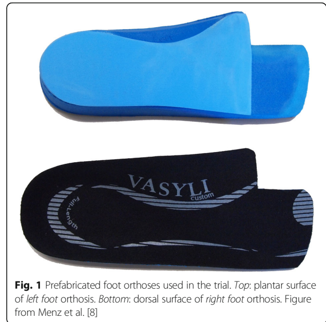
Fig. 1 Prefabricated foot orthoses used in the trial. Top : plantar surface of left foot orthosis. Bottom : dorsal surface of right foot orthosis. Figure from Menz et al. [8]

The prefabricated foot orthoses group received a pair of foot orthoses (Vasyli Customs Medium Density, Vasyli Medical ™ , Queensland, Australia) that were modified using a similar approach to that described by Welsh et al. [26], involving the addition of a cut-out section beneath the first metatarsal and trimming the distal edge to the level of the 2nd to 5th toe sulci (Fig. 1). In participants with pronated feet (a Foot Posture Index [FPI]