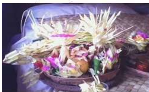
Figure B. Banten Otonan