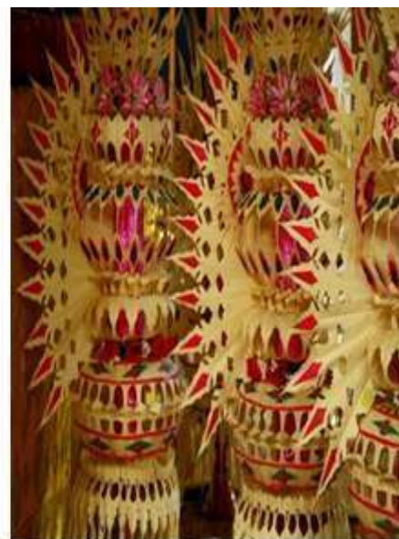
Figure C. Hiasan Janur

The comparison of interviews with religious literature guidelines in Bali that the implementation of yajna as in the form of yajna picture A, B.C not enough just known and understood it, but must be accompanied by pengayataannya, practice in the form of everyday behavior and the most important society. The intensity of prayer, prayerfulness, making upakāra will increase the attitude, morale and behavior towards a better and true quality of life in accordance with Dharma rules. Because each Upacara and Upakāra is a translation of the teachings of religion and has the essence of self-study, in organizing life and life, so that it can pursue the main goal of this birth, namely "Mokshartam Jagadhita" (welfare and happiness),