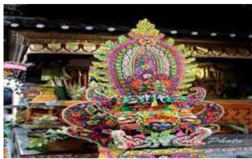
Figure A. Pregembal

The ceremony made in the city does not distinguish between the size of the bebantenan, but in the village, the ceremony for the formation of ceremonies can be done by the community, while the ceremony is considered to contain high magical meanings made by special people. The spending of money for small ceremonies can be done by the general public, while spending money for larger ceremonies is done by a special person. Where gender economic activity is associated with the eight characteristics (Asta iswaryanya) that accompany each life of the people.