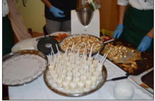
Figure 3: Food products test

• After collecting and analyzing the ideas presented by the children, the authors separated them in several areas: food products, engineering and services. Later discussing the logistic aspects we had choose the food products area for a first experience. Then these were presented to young undergraduate students at Polytechnic of this area. They had understood them and study how they could implement them by using their knowledge and creativity. During this process of developing the idea the authors were updated time to time. Before the final meeting the food products were present and explained (Figure 3).