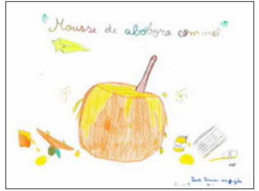
Figure 2: Drawings from the children