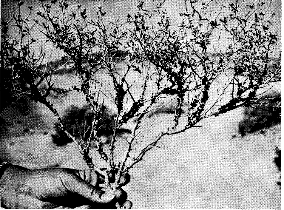
Portion of a plant of Dalea emoryi , one of the desert indigo bushes, heavily parasitized by Pilostyles thurberi (Rafflesiaceae). The other species of the small genus Pilostyles are found in Central and South America, southwest Australia, Iran, Syria, and Africa.