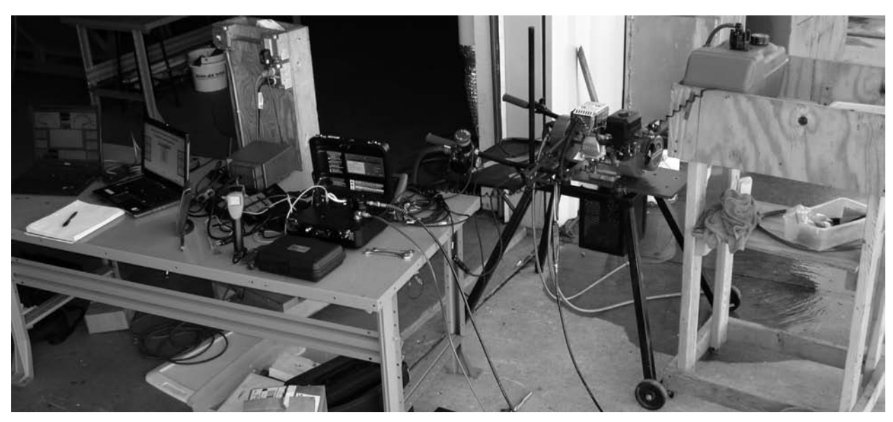
Fig. 1. Experimental setup for fuel testing.