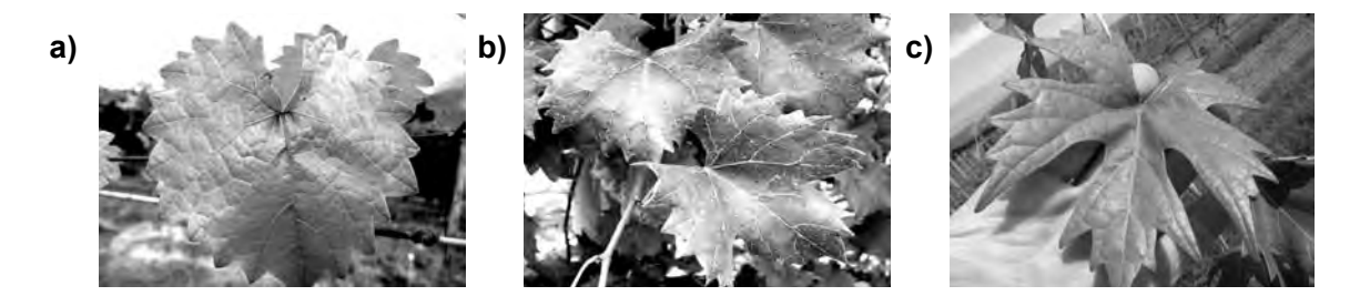
Fig. 1. Muscadinia leaf types classified in Study 2. – Standard muscadine leaves lacked lobing on the leaf margins (a), while the lobed types (lobed and intermediate) had medium-deep lobing (b), which were found in a limited number of seedlings, to very deep lobing (c), the most common form of leaf lobing found.