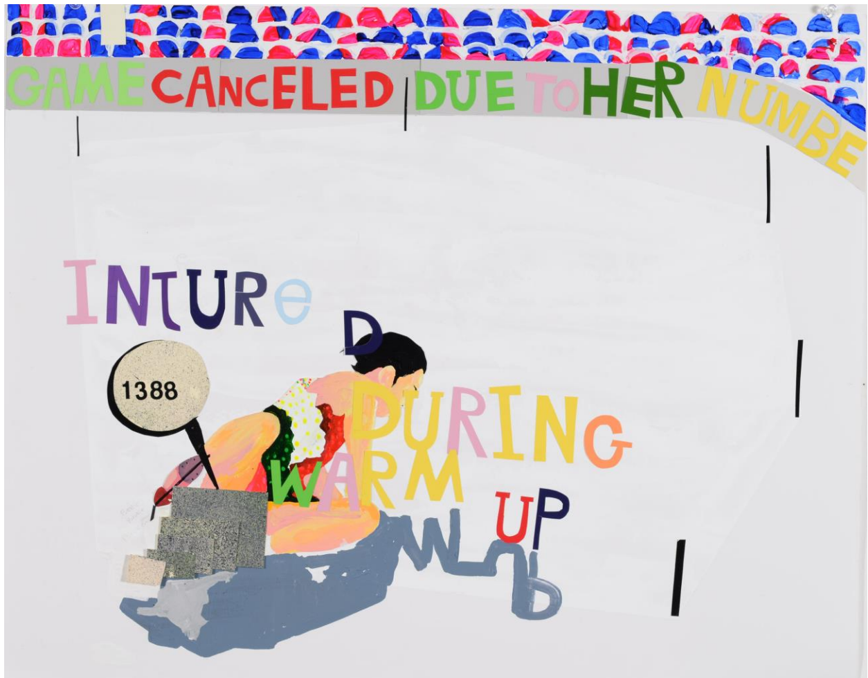
Figure 2: Maryamsadat Amirvaghefi, Injured During Warm Up , 20 x 26 in, Mixed Media on Paper, 2017.