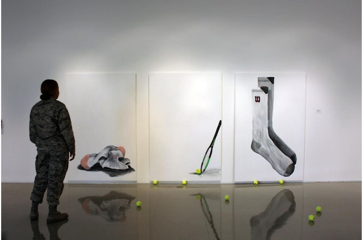
Figure 8: Maryamsadat Amirvaghefi, OFFSIDE (Gallery View), 2017.