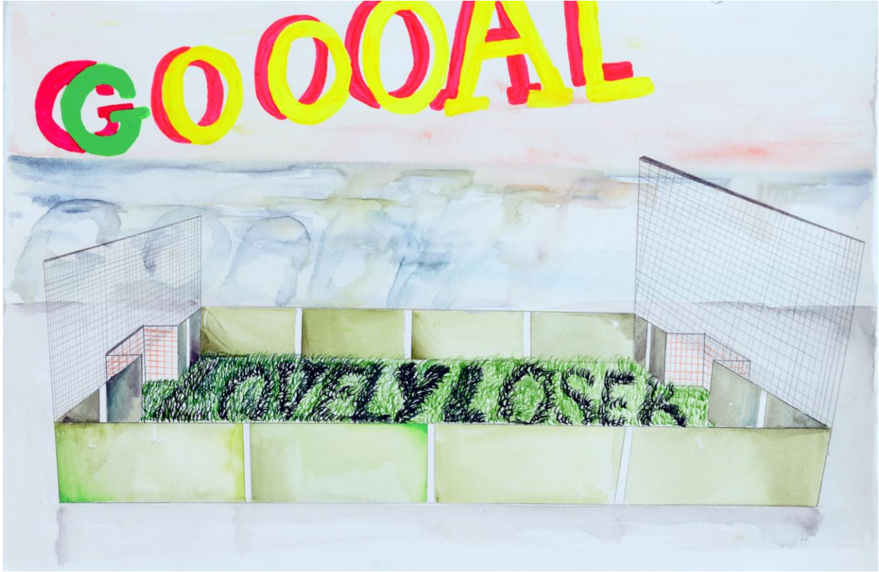
Figure 3: Maryamsadat Amirvaghefi, GOOOAL , 18 X 24in, Mixed Media on Paper, 2017.