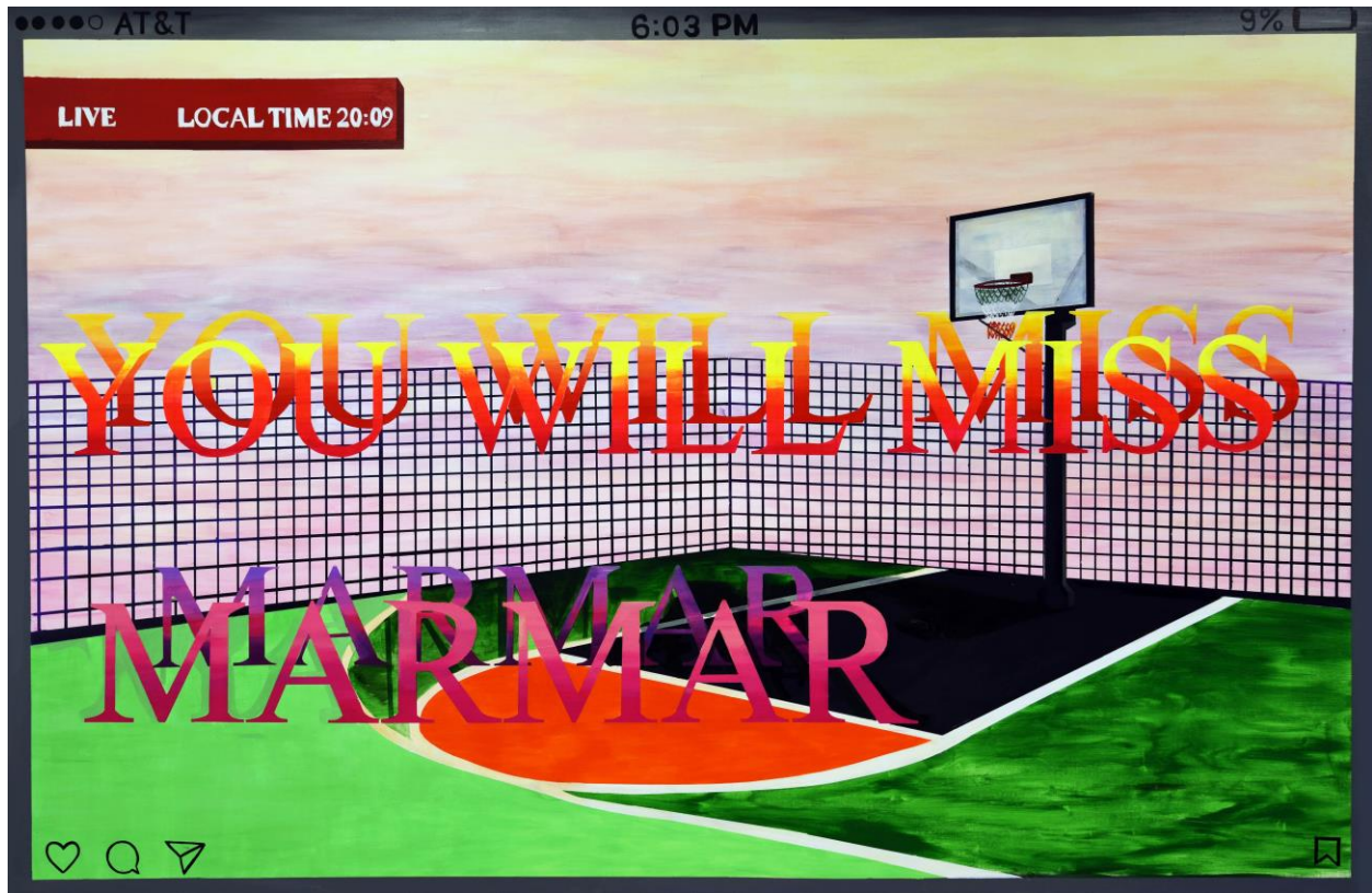
Figure 5: Maryamsadat Amirvaghefi, You Will Miss Her So Bad , 48 x 72in, Acrylic on Panel, 2017.