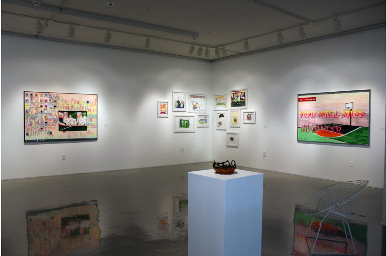
Figure 7: Maryamsadat Amirvaghefi, OFFSIDE (Gallery View), 2017.