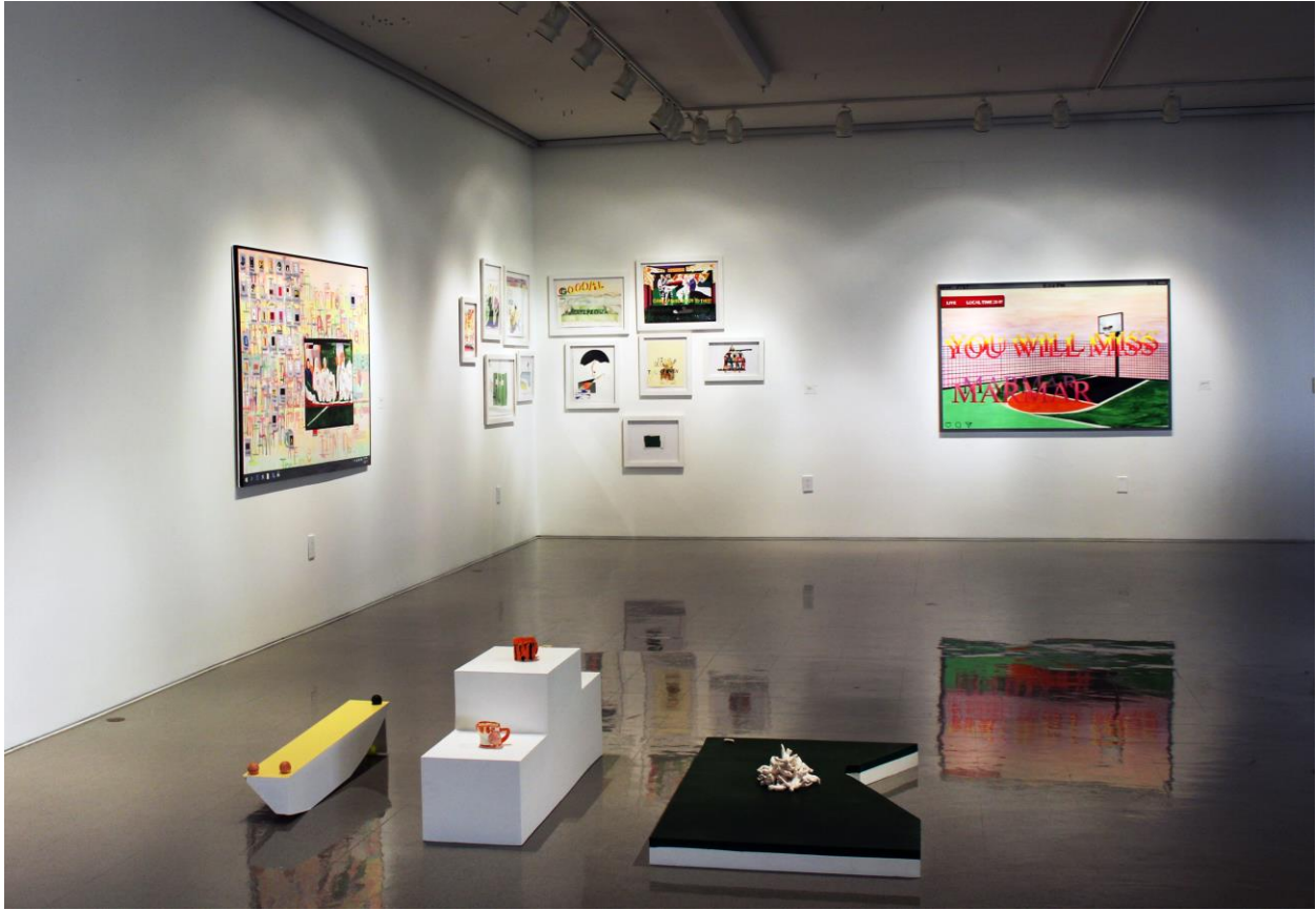
Figure 6: Maryamsadat Amirvaghei, OFFSIDE (Gallery View), 2017.