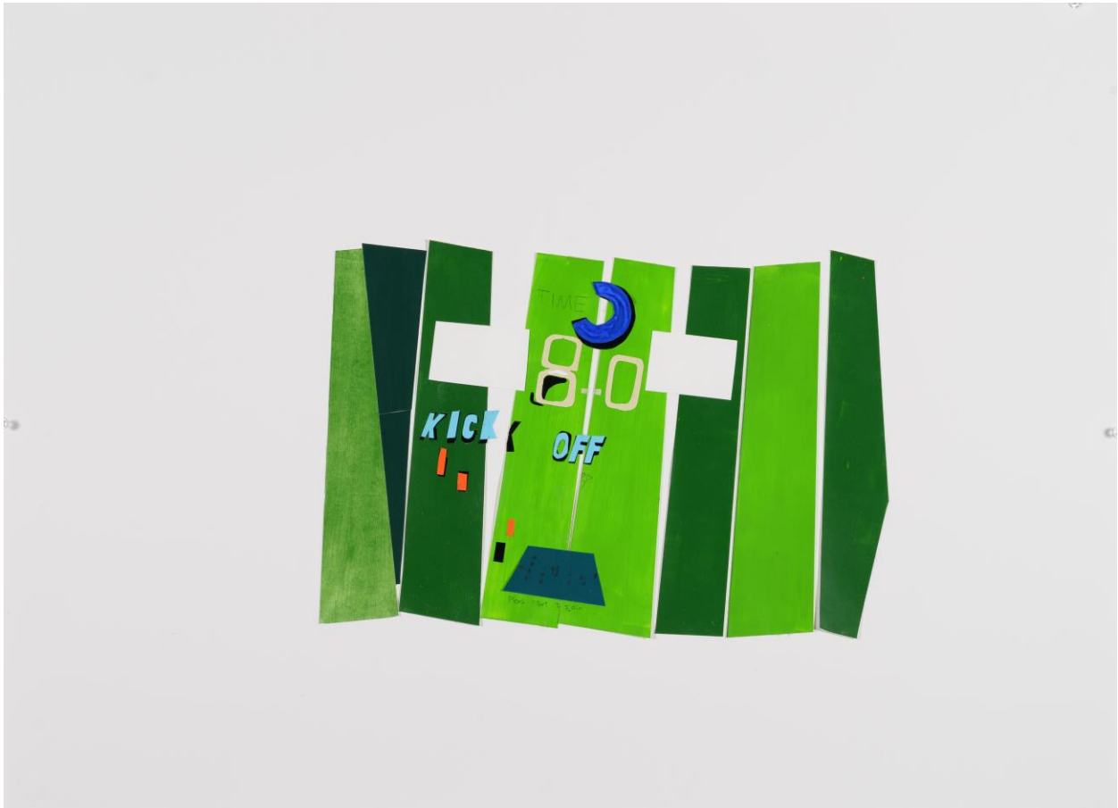
Figure 1: Maryamsadat Amirvaghefi, KICKOFF , 18 x 24in, Mixed Media on Paper, 2017.