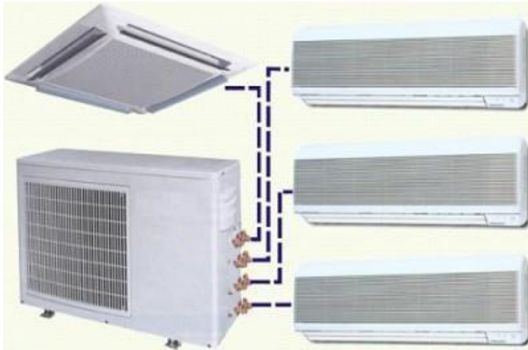
Fig. 2. Autonomous ACSs

It requires only power supply to function. The system consists of separate units that are wall and ceiling coolers, placed in premises, and the external unit performing heat removal (should be placed as described in the previous paragraph). As it is said in press, one external unit can bear up to 16 coolers that is one unit allows to cool the air in 16 premises. The given ACS, also called split-system, cools and dries air.