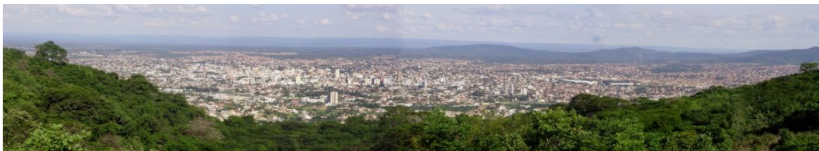
Photo 1. Panoramic view of Montes Claros (Jean-Claude Bolay, 2015).

authors emphasize, however, that “this consideration should not only be based on demographic criteria or the role the city plays at the regional level, but should also take into account its economic infrastructure and services”. 63% are working age (15 - 59), and 7% are aged over 60. In 1963, Montes Claros became the first northern municipality in the State to found an institution of higher education. Today, it has two public universities and 17 private higher education institutions, as well as several technical training schools (ACI, 2012), that serve a total of 30,000 students. Montes Claros also has a top-rate offering when it comes to the health and medical field, with eight hospitals, three polyclinics, 15 urban health centers and 20 rural centers. Most of these are public institutions, though several are managed privately 3 .