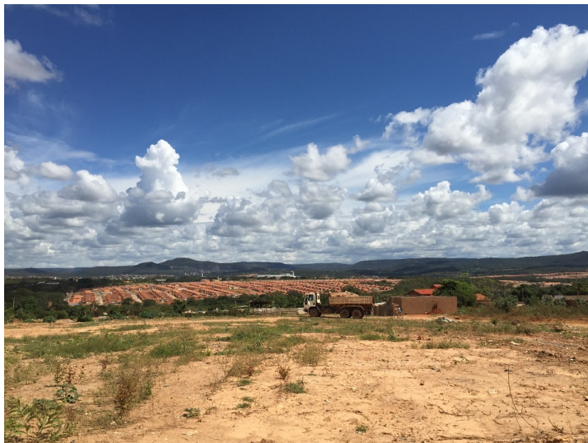
Photo 5. New social housing settlement in Montes Claros (Jean-Claude Bolay, 2015).