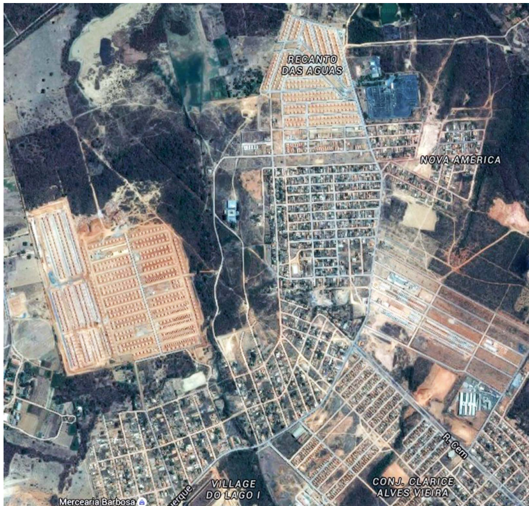
Photo 7. New suburb neighbourhoods in Montes Claros.

deterioration of its forest-covered hills and its rivers). What prevails are personal and political interests that couple political action and financial advantages to benefit the local elite.