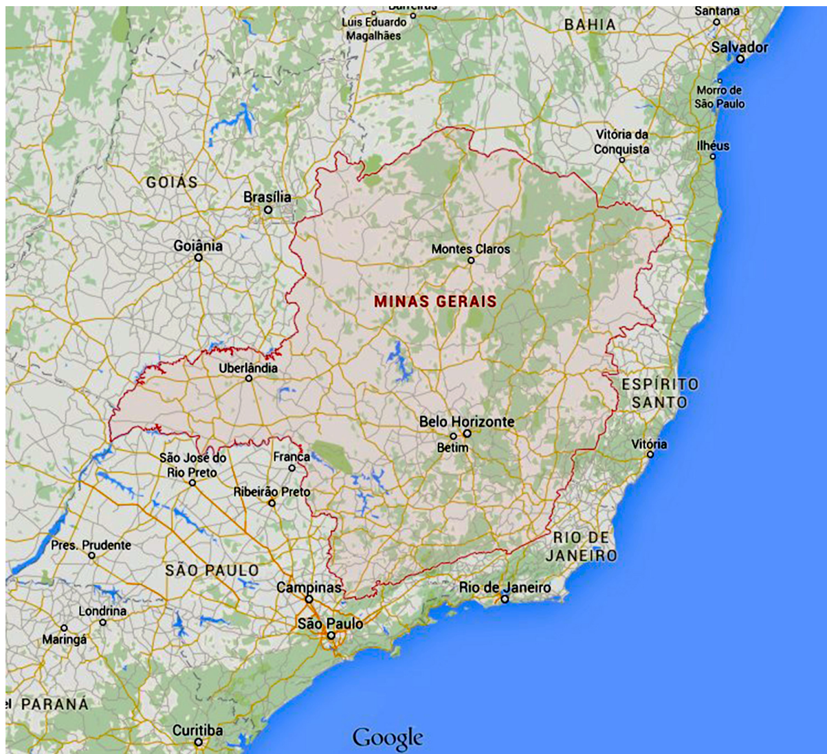
Figure 1. Geo-spatial location of Montes Claros (Google map, 2015).

including 97 km 2 of urban territory corresponding to the urban perimeter 2 and an average altitude of 638 meters. The average annual temperature is 24.2°C, with two seasons: a hot, rainy season and a long, dry season (Gomez & Lamberts, 2009). The average high temperature is 29.3° and average low is 16.7°. The maximum temperature exceeds 40° at times. The municipality of Montes Claros has existed since 1831, obtaining city status in 1857. The IBGE estimated the city's population at 361,915 in 2010 and 390,212 in 2014, with a population of 20.7 million in the State of Minas Gerais and 202.8 million in Brazil. Today, it is an urban hub for a region of roughly 2 million people (Prefeitura de Montes Claros, 2015).