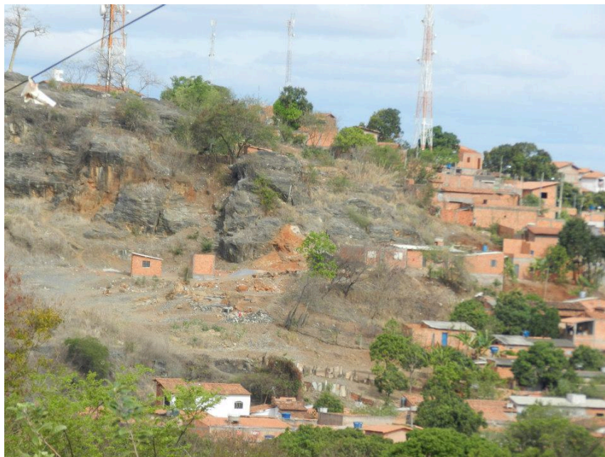
Photo 4. Recently built outskirts of Montes Claros (Jean-Claude Bolay, 2015).

Other technical questions relate mainly to: the electric power supply (inadequate in certain suburbs), harvesting, recycling and solid waste treatment 17 (while landfills exist, they do not comply with environmental protection standards and have a negative impact), land use (which is poorly regulated), seismic monitoring and protection measures (in the event of earthquakes), and transport systems.