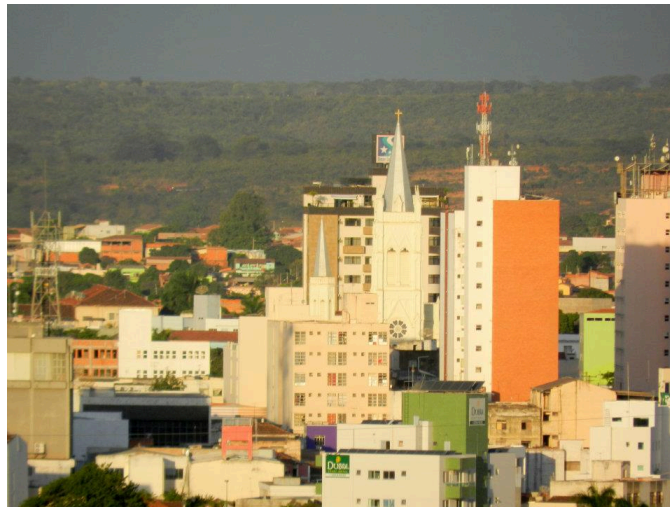
Photo 2. City district of Montes Claros (Jean-Claude Bolay, 2015).