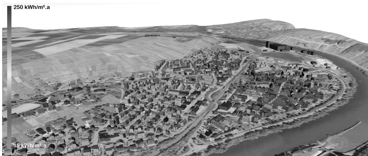
Fig. 3: Specific heating demand calculated with SimStadt, view in a Web browser (originally in color).

For the whole studied area, the total yearly heating demand reaches 3.9 TWh, with an average specific heating demand of 145 kWh/m 2 .yr. Considering the heating system distribution available for each municipality (from census data survey), this corresponds to 0.92 Mega-tonnes equivalent CO 2 per year.