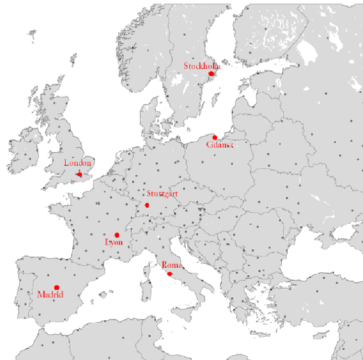
Figure 1: 334 considered weather station for the study (Meteonorm7 Data).

To create meteorological mappings of Europe, more than 300 weather stations in the whole Europe, Maghreb, Middle-east and Russia have been considered, for a final spatial resolution of 200-300 km.